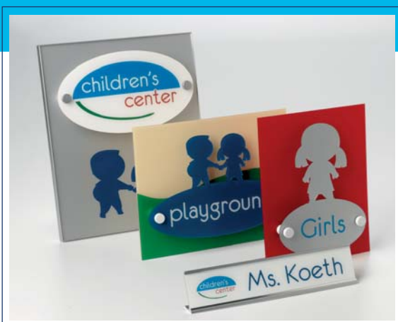
Reverse LaserMark® Sign Kit item #9035

You may place your Reverse LaserMark® Sign Kit order at www.rowmark.com , or fabricate the signs on your own using the file found under the downloads section of our website.