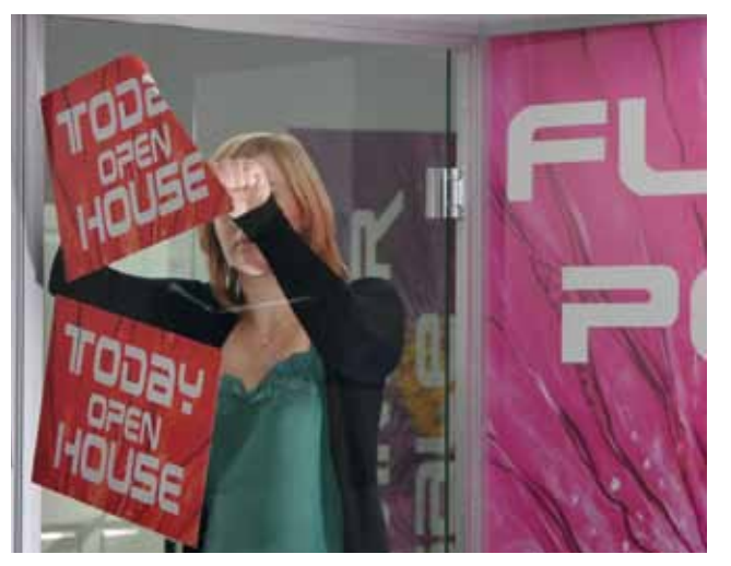
Applying advertising posters to shop windows is child's play with gudy window!

Available widths: 104cm, 130cm, 140cm + 155cm