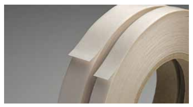
gudy 831 is also available in narrow widths!

Available widths: 61cm, 104cm, 122cm + 130cm